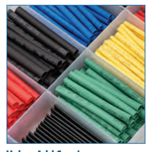
Value-Add Services Cut-to-length Heat Shrink, Sleeving, Conduit and Loom