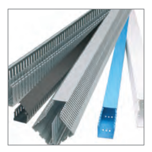
Wiring Duct Solid, Slotted, High-Density & DIN Style