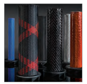
Protective Sleeving Braided, Expandable, Coated, Electrical & Thermal Insulation

We can determine and provide the best solution for your application, from heavy-duty conduit to lightweight sleeving.