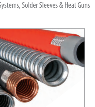
Conduit Metallic, Non-Metallic, Liquid-Tight & Fittings