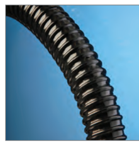
Loom Slit & Non-Slit Loom, Specialty Materials, Fittings & Accessories