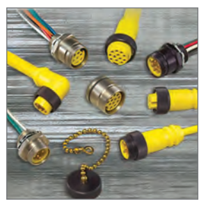
Molded Connectors Mini-Connectors & Cord Sets