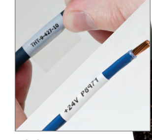
Labels Vinyl self-laminating, heat shrinkable, pressure sensitive, custom labels