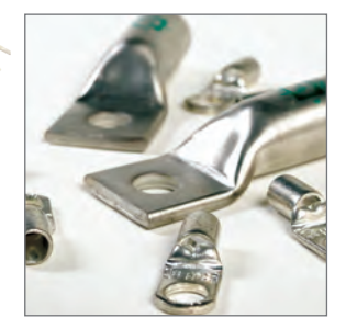
Lugs & Power Connectors Compression, Split-Bolt, Mechanical & Tooling

Lugs, terminals and ferrules, as well as manual, semi-automatic and automatic tools that make connecting safe, fast, reliable and repeatable.