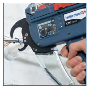
Boost Efficiency Automatic Tools Reduce Operator Fatique, Promote Worker Safety, and Improve Productivity