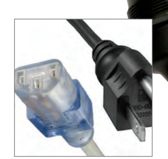
Cord Sets North American, International, Hospital Grade