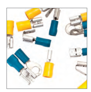
Terminals & Ferrules Applicators, Reel-Fed & Crimp Seal, Contacts