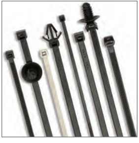
Cable Ties & Accessories Manual loose-piece, automatic reel-fed, clips, clamps & mounts

IEWC carries thousands of bundling and routing options as well as a variety of ergonomic application tools to ensure worker safety.