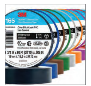
Tape Vinyl, Insulating & Specialty