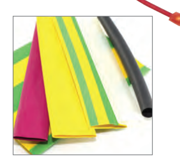
Heat Shrink Tubing Tubing, Shapes, Boots, Marking Systems, Solder Sleeves & Heat Guns