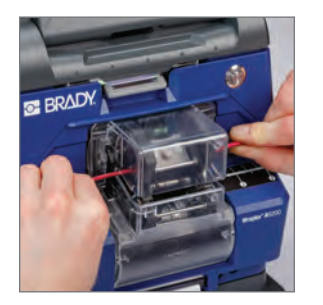
Printers Benchtop Printers, Applicators, Software to Print/apply Adhesive and Heat Shrinkable Labels

Component identification ensures accurate installation and makes future troubleshooting faster.