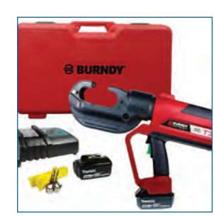
Crimping Tools Reduce Strain, Increase Productivity and Improve Safety