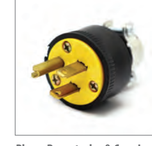
Plugs, Receptacles & Cam-Locks 15, 20, 30, 50 Amp & Industrial Connectors